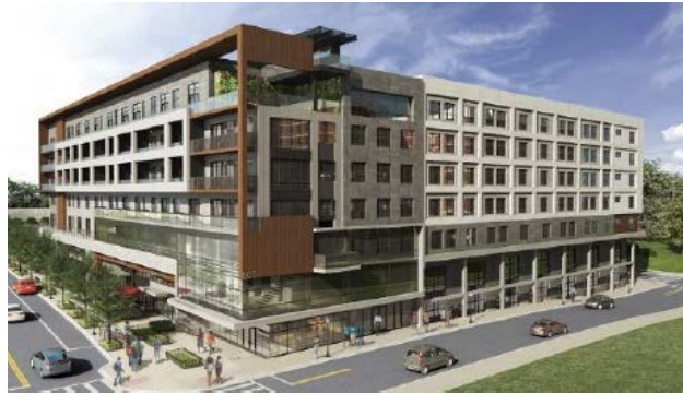
Lower Sherman Avenue Apartments