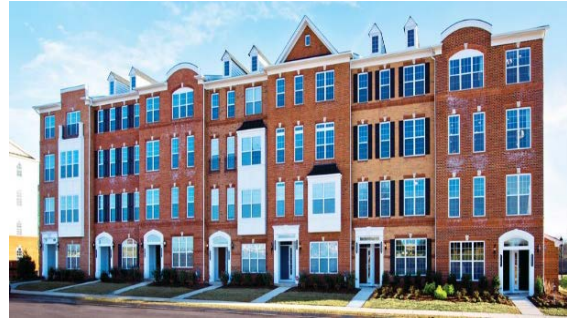
The Buckingham – Toll Brothers