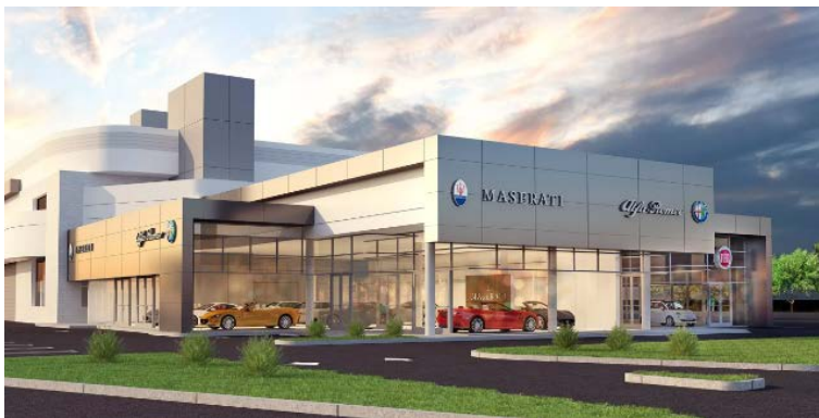
Maserati of Arlington

GEOTECHNICAL ENGINEERING, INSPECTIONS & TESTING: From investigating site conditions to inspections and testing of construction materials, we are on the project site providing quality control and assurance to commercial and residential projects.