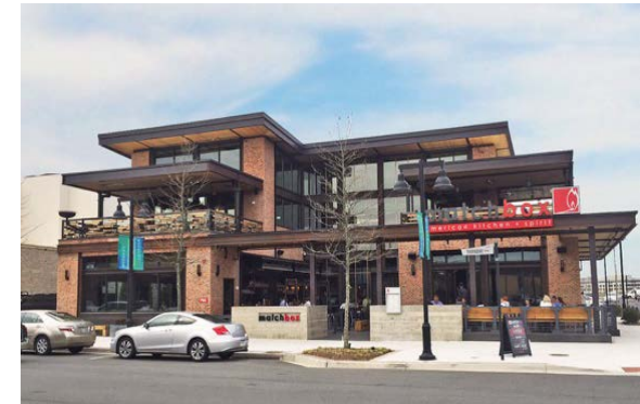
Matchbox - Ashburn