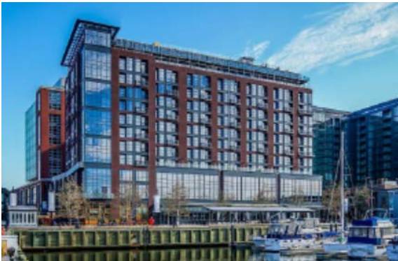
The Wharf International Hotel