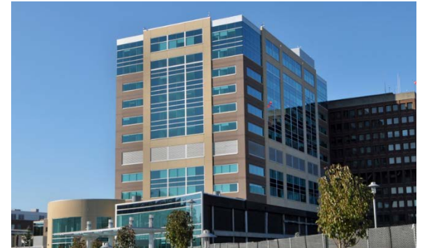
Inova Hospital System