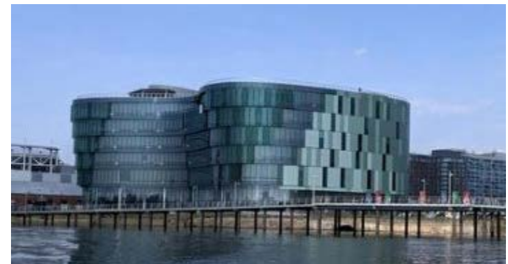
DC Water Headquarters