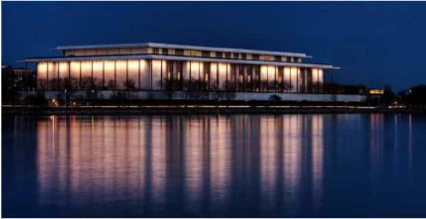
The Kennedy Center