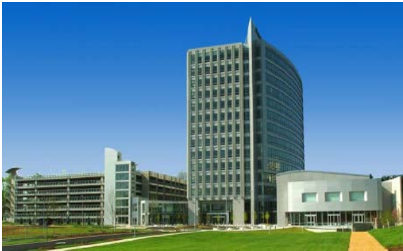
Capital One Headquarters